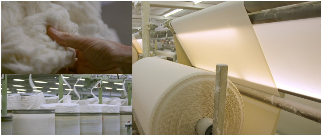
Weaving and finishing of bedlinen at Standard Textile and Tissage Mouline (Vosges, France)